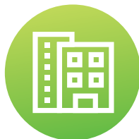
YOUR HEALTHCARE PROVIDER'S OFFICE

Depending on your insurance coverage, your Patient Care Coordinator will arrange for your infusions to be given at a location of your choosing – at an infusion center, in your own home, or at your healthcare provider's office. If you decide over time that another location would be more convenient for you, simply let them know.